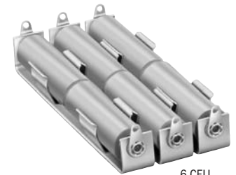
6 CELL CAT. NO. 193 CAT. NO. 197