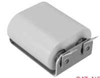
CAT. NO. 223