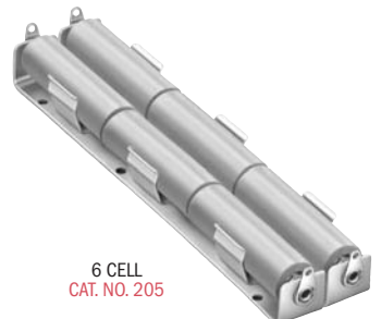
6 CELL CAT. NO. 205